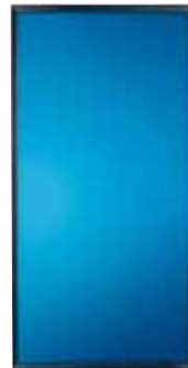
NIBE Solar Panels NIBE Solar FP215 P *Art no 057001 (2 or 3 pcs)