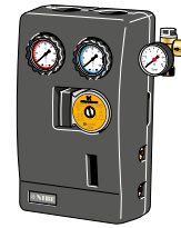
NIBE Solar pump station SPS10 *Art no 057027 (1 Pcs)