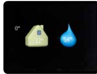
The information window

Operating settings, systems settings and factory resets are here.